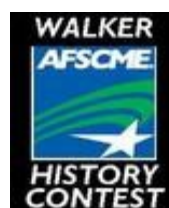
District Council 57 Contest